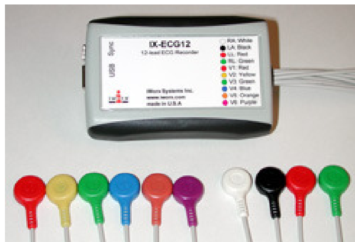
Figure HH-13-S2: The IX-ECG12.